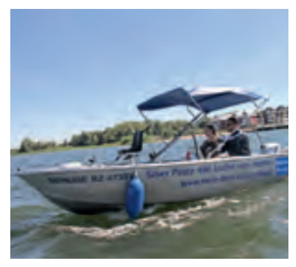
The Silver Pirate 490 is designed to meet the needs of anglers: four rod holders and a built-in small wet storage basin, a comfortable seat, optimal electronics for fishing and plenty of space for fishing equipment. With the flat bottom made of seawaterresistant aluminium, it can run aground on the beach, the robust material can sometimes take a bump without being damaged.