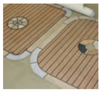
Whether it is a new owner's suite, a new teak deck or just a cockpit table in need of refurbishment we use the highest quality wood and modern materials in our modern workshop. We apply the best of traditional craftsmanship with current methodologies. We also can also repair damaged cabinets or install new kitchens.