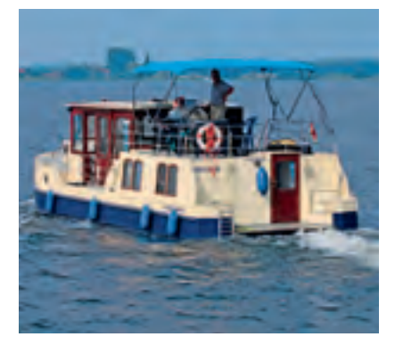
The flagship in our fleet. Customizable from one to four cabins: the new Kormoran 1500, Kormoran 1290 and Kormoran 1280. This traditional steel boat series has been developed over several decades to keep pace with modern developments. Used we can offer too: Kormoran 1280, 1140 and 940.