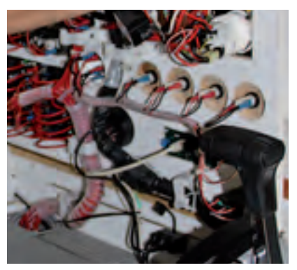
We strictly adhere to the highest industry standards in our electrical works. Small technical enhancements can make all the difference: for example LED lighting, audio and video systems with an interface for external devices, a range of additional electronics like fish finders, electrical accessories for navigation, telecommunication, internet and independent power supply.