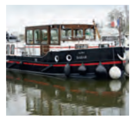
40 years of experience means we're confident we can delivery your ideal boat in the most cost effective way. If you would like the Kormoran in a different colour or like to design the cabins differently, we will be happy to do so. Occasionally, one of the private Kormoran boats is available second hand on my-boat.co