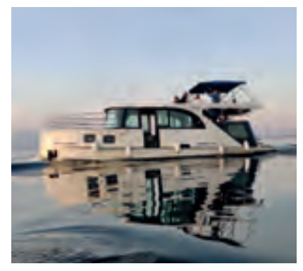
Need a little more luxury? Have a look at our boats with a range of extras. Modern design, many technical refinements and the large bathing platform make the boat an elegant holiday home.