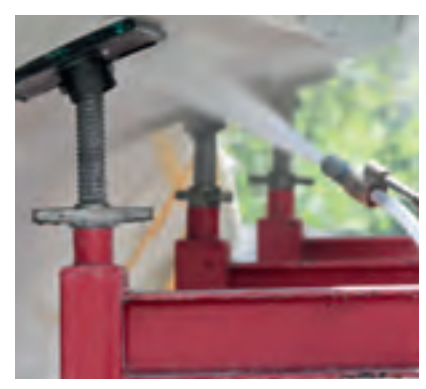
Engine, battery maintenance, oil change, disposal of waste oil etc.

CLEANING AREA: Directly next to the crane facilities is our environmentally friendly boat washing area.