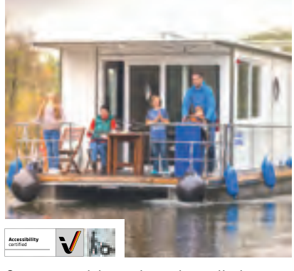
Our moored houseboat has all the conveniences. It can be bespoke and built with up to 2 cabins. Pontoons made of seawaterresistant aluminum, durable aluminum frame construction, GRP outer walls, good insulation and thermal insulation glazing, good driving properties and accessibility make it a good investment that can be used all year round.