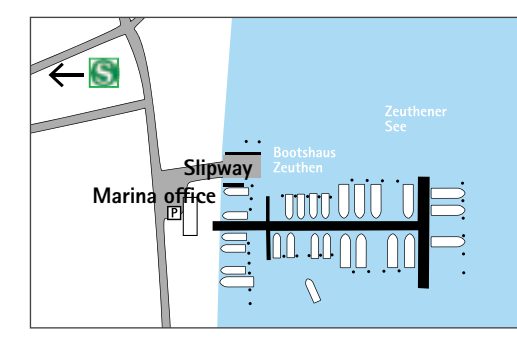
Dorfaue 5, 15738 Zeuthen, Germanymy-boat.co/berlin-zeuthen

Berlin has been the stage for a lot of world history, and not just the fall of the Berlin Wall. You can still discover the traces of history in countless places around the capital. Berlin is also a proper shopping destination: besides luxury shops along Kurfuerstendamm, you will also want to check out the numerous flea markets.